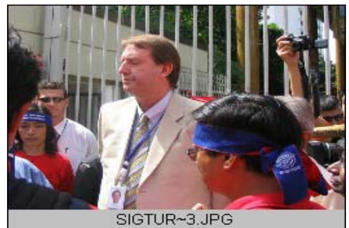
Turning up the heat in Bangkok: SIGTUR protests Australia's intended dismantling of labour laws.

The Australian Ambassador to Thailand looked somewhat hot and bothered as a rowdy group of trade unionists from South Africa, India, Korea, the Philippines, Singapore, Thailand and indeed, Australia, confronted him in front of the embassy in Bangkok. They were protesting the proposed labour law reform in his home country. The irony of mostly Asian trade unionists protesting about labour rights in Australia could not have escaped him. The event received wide media coverage in Australia and in Thailand and coincided with mass rallies in Australia in protest of the same issue.