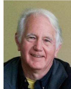
members to the Board.