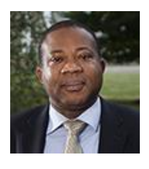
International Sociological Association